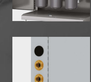
Unique connection system so that water flow can be connected to the left or right hand sides for fast, neat and easy installation.