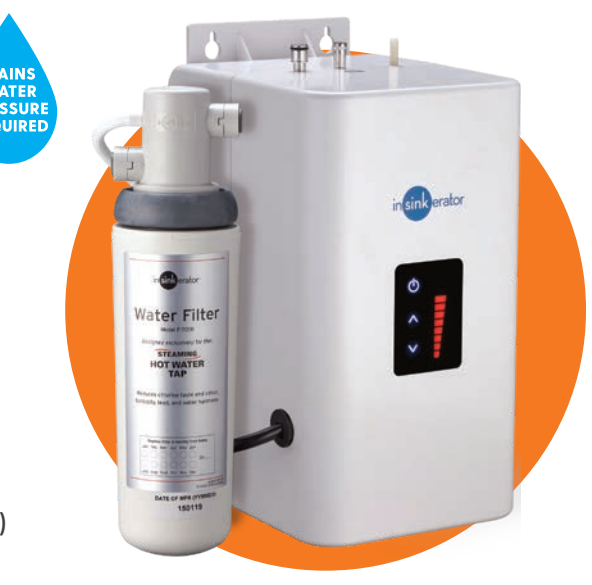
Product Code: MTJUNO-BR Finish: BRUSHED

Easy to install under sink tank & water filter