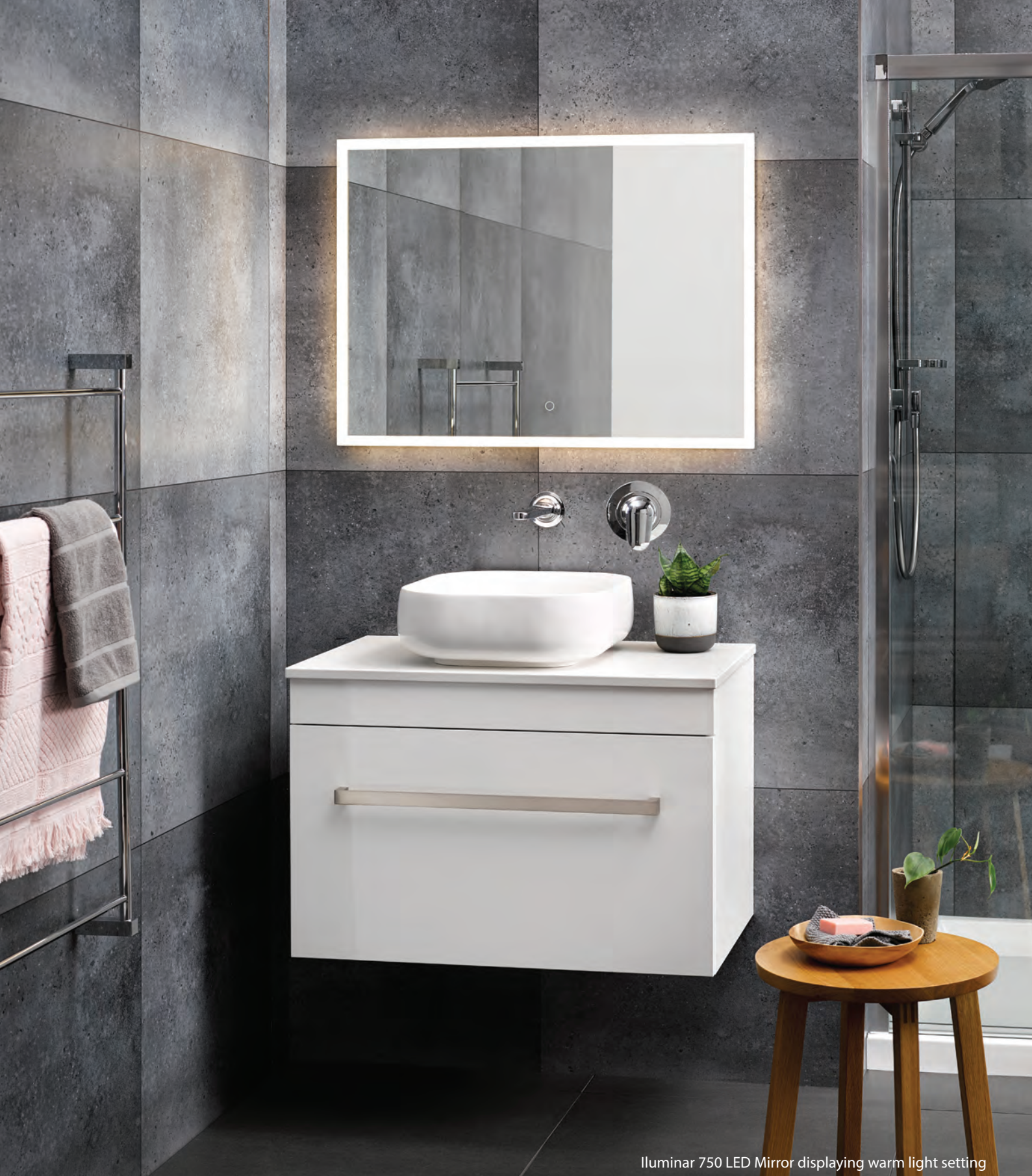
Iluminar 750 LED Mirror displaying warm light setting