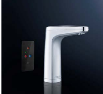
XR Remote in Chrome * To order a touch tap change Product code on page 2 from L to R

XT Touch in Chrome * To order a touch tap change Product code on page 2 from L to T