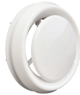
200mm Ceiling 'ECO' Diffuser