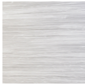
Brushed Nickel SR230NK