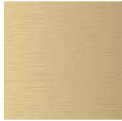
Brushed Brass SR230BB