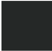
Matte Black SR230B