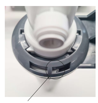
Cartridge NOT in the correct position.