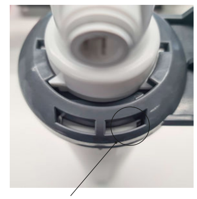
Cartridge is in the lock position and will not rotate any further. Arrows on the side of the cartridge are aligned.