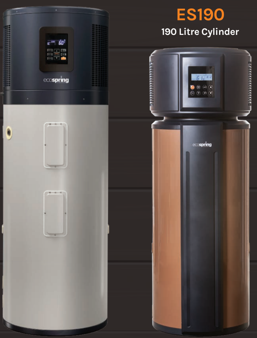
Suitable for 3+ person household with standard water use

Suitable for 1-2 person household with standard water use