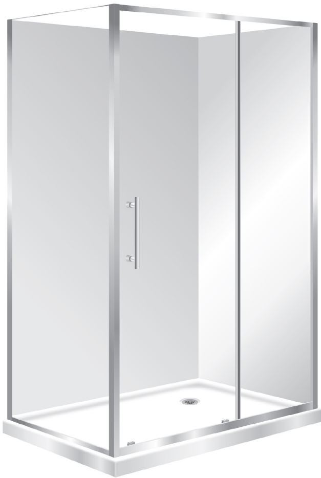
Pictured - Aquero 1200 x 900 2 Panel Sliding Door Right Hand Tray Configuration Flat Wall Silva SKU S12X9AQRSRHSIFWZ