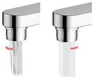
Sink - Dual Spray Aerator Twist to change

BASIN: Fitted with the all-directional aerator.