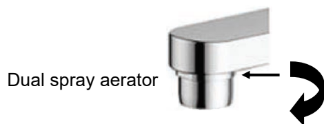
Dual spray aerator