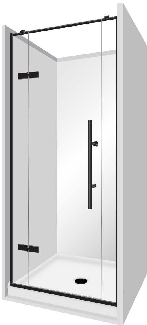
Pictured - 900 x 900 x 900 Alcove Black