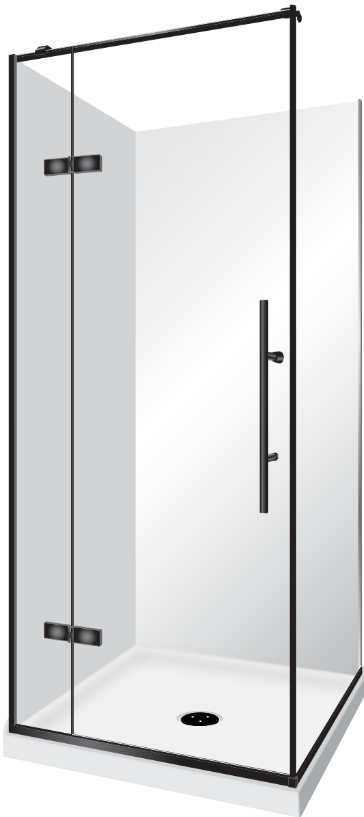
Pictured - 900 x 900 Flat Wall Black