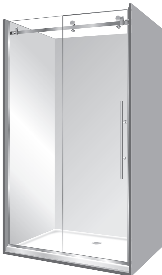
Pictured - Premier Frameless 12 x 1 Silva Alcove LH Fixed