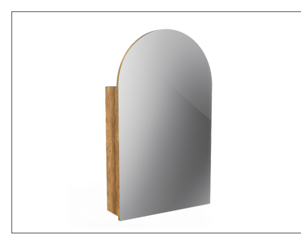
Figura 600mm Arch Mirror Cabinet, Left Hand Hinge